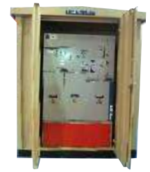
SF 6 Insulated Compact Type Medium Voltage Switchgear