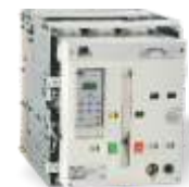
ACB As per Transformer kVA Low Voltage Switchgear